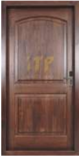
Solid Teak Panel Door