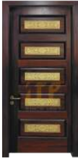
Solid Wood Door