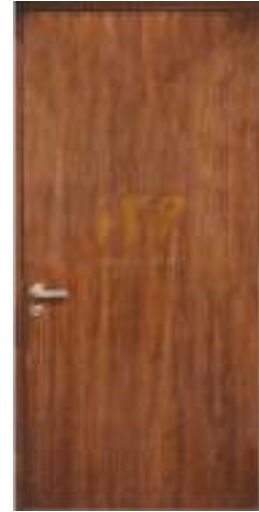
Fire Rated Door